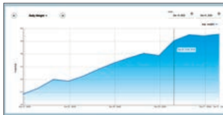
Daily average weight of the group