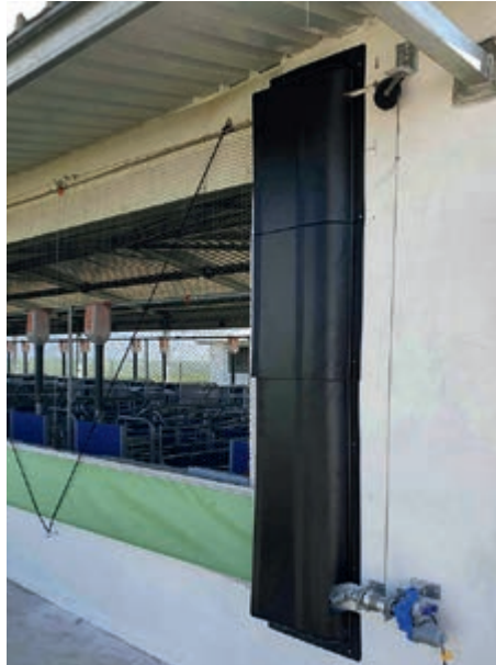
The winch motor securely winds and unwinds the curtain