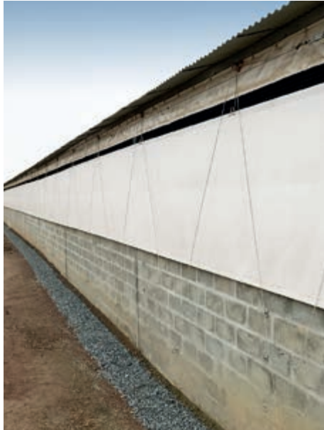
White curtains reflect the sunlight