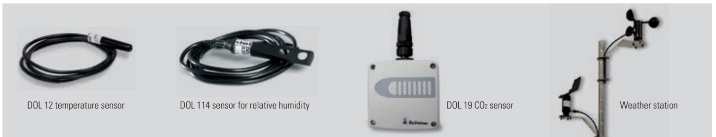
DOL 12 temperature sensor

therefore the basis for any computer-controlled climate system. Big Dutchman can provide the full range of state-of-the-art sensors.