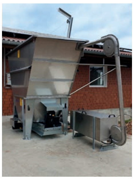
Dispenser for roughage (straw, maize silage, hay, lucerne, etc.)