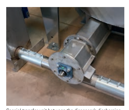
Special transfer unit between the dispenser's discharging auger and the DR 1500 pipe conveying system