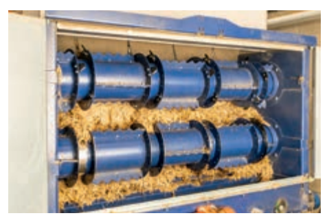
Breaking up straw bales with rollers

Animal-friendly management systems, a good climate in the barn, emission reduction and labour efficiency are the requirements of today and tomorrow. For more PureLine products