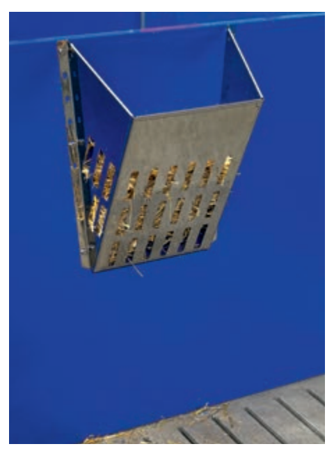
Stainless steel straw rack