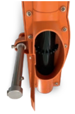
Pneumatic valve for dispensing in the barn