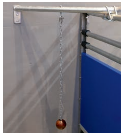
Playing chain with wooden ball

Let our experts advise you. In a detailed consultation, they will help you find the best solution for your requirements.