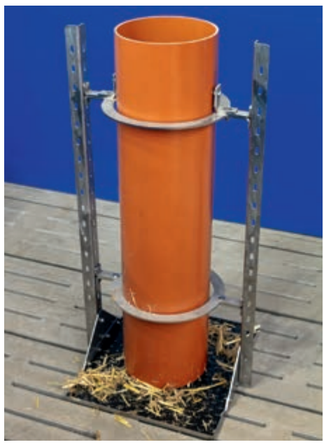
Installation standing in the pen or fitted into the partition. Filling can be manual or automated.