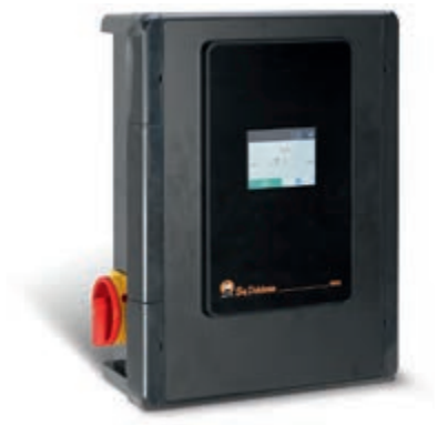
The DryRapid BD 103 controller controls the entire system