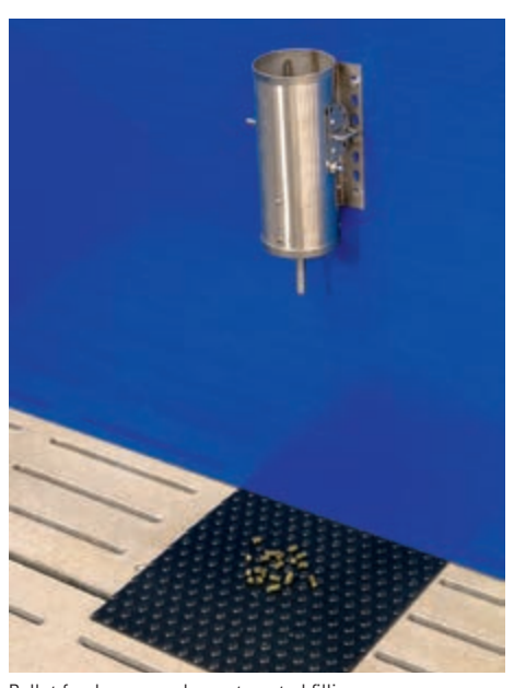
Pellet feeder: manual or automated filling