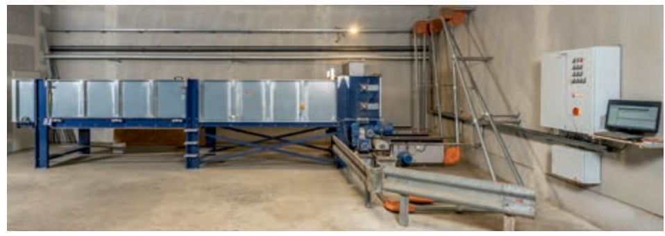
Dosing bunker with scraper floor for straw storage

We also offer a straw bunker with scraper floor for up to three rectangular bales. Our well-proven DR 1500 pipe conveying system transports the straw into the barn.