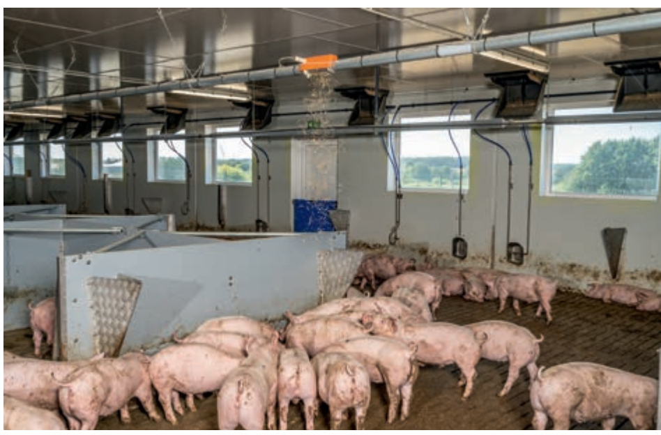
Straw dispensing with a pneumatic valve