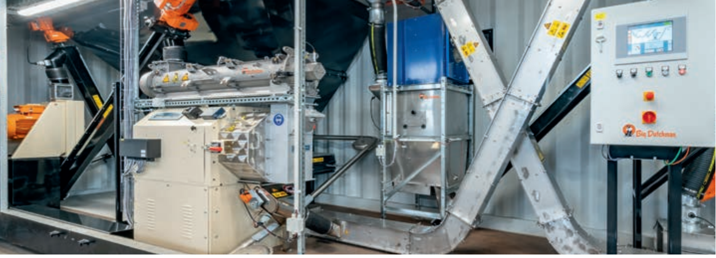
Supply in a 40-foot HC container with a CSC plate is possible, i.e. the container is approved for international transport on container ships