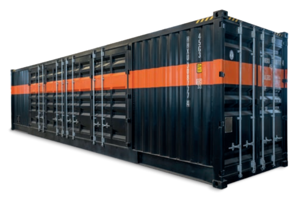
Ready-to-connect delivery of BD PelletBox 750 in a 40-foot HC (high-cube) container (12192 mm x 2438 mm x 2896 mm)

Interested? Then please contact Big Dutchman for an extensive consultation with one of our experts.