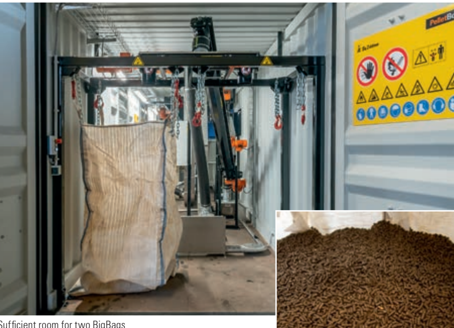
View of the BigBag bagging unit