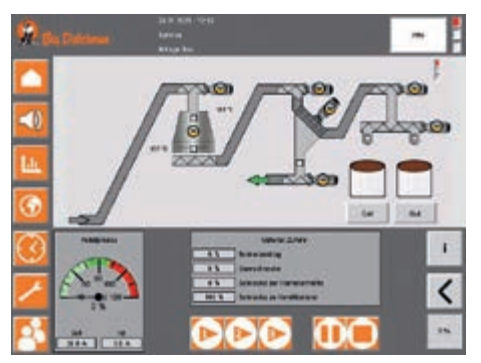
Display of important system status information

the hammer mill or of the dosing auger that transports material to the pellet mill can also be retrieved. A sensor reports when one of the BigBags is full and needs to be replaced. The control cabinet itself is located in a