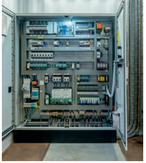
Control cabinet integrated into the container

separate room and therefore protected from dust and other influences.