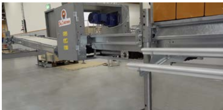
EggTrax egg belt drive ensures secure egg transfer at any height