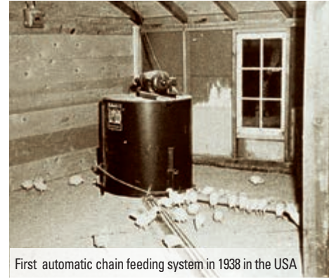
First automatic chain feeding system in 1938 in the USA

continuously being improved and adapted to today's requirements for modern poultry production. The Big Dutchman feed chain CHAMPION can be used for any type of production, including layer breeders kept in cages, pullets from their first day of life and laying hens. The chain also feeds broiler breeders reared on the floor and is furthermore a great option in alternative egg production.