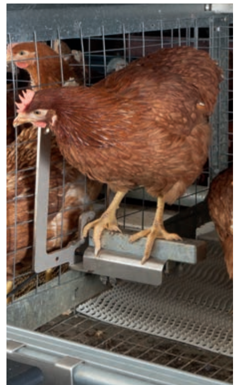
Incas 2 in an enriched colony system