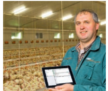
With the tablet, directly in the barn