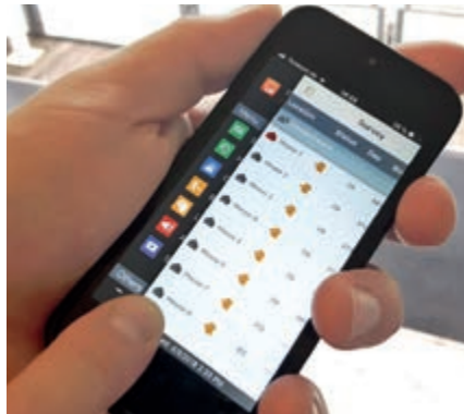
With the smartphone on the go

The BigFarmNet app will change your daily work. Writing notes and tediously copying them afterwards will no longer be necessary. For example, you can input bird weights you measured manually into the app. These data are then immediately available for analysis in BigFarmNet Manager. Big Dutchman has of course ensured that all communication is encrypted.