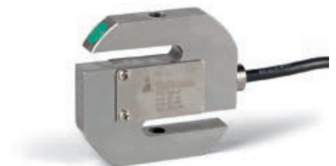
Load cell for Swing 20 and Swing 70

weight data. Swing 20 is suspended from the barn's ceiling. During the service period, the scale can easily be removed for cleaning while the weighing electronics remain installed close to the ceiling where they are protected against dirt.