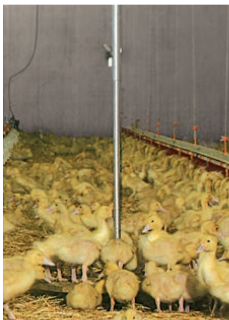
Swing 20 in a house for duck growing