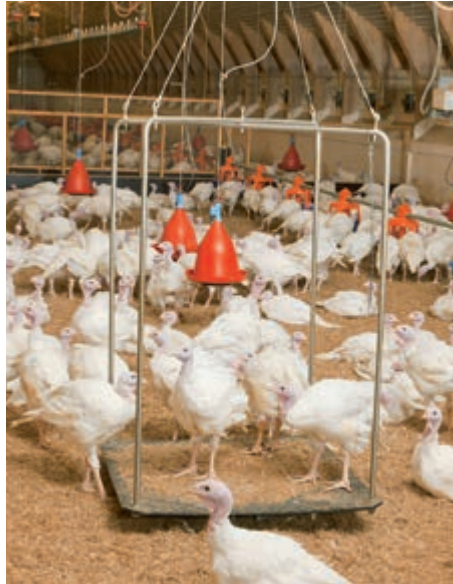
Swing 70 in a house for turkey growing

Swing 70 consists of a 1 x 1 m large plastic plate that is fixed to two stainless steel brackets. Swing 70 is attached directly to the load cell by means of four suspension ropes and snap hooks. The suspension point is quite high, keeping swinging motions to a minimum to ensure that the birds accept the scale. This guarantees a high number of weighings and therefore precise weight determination. The scale comes with a winch so that its height can easily be adjusted to meet the birds' age. For cleaning with a high-pressure cleaner, the scale can be released from the snap hooks.