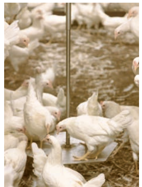
Swing 20 (stainless steel) in a pullet rearing house