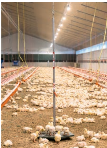
Swing 20 in a broiler house