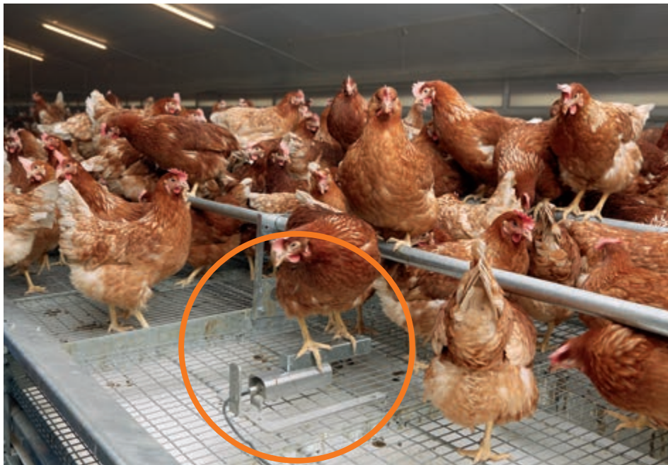
Incas 2 in a layer aviary

like a perch, ensures a high number of weighings and therefore precise weight determination.