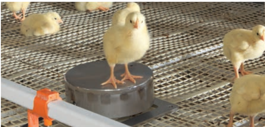
IncasCompact in the AviMax broiler system

IncasCompact is a poultry scale ideal for weighing pullets as well as broilers kept in the AviMax system. It is entirely made of stainless steel. The circular weighing platform has a diameter of 15 cm. IncasCompact is simply placed on the floor where its two feet hook into the flooring. Thanks to its compact design, the scale can also be used for mobile weighing.