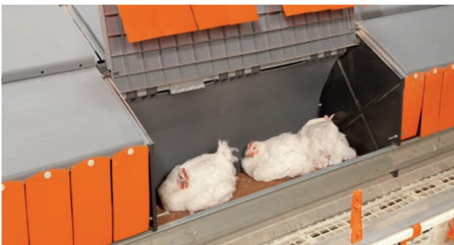
Nesca determines the hens' weight while they visit the nest

Nesca consists of a bottom wire mesh which rests on four load cells. The load cells transmit their results to the production computer via a weighing module.