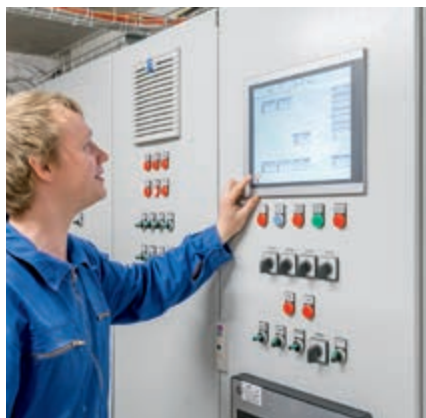
15" touchscreen in the amacs control cabinet

Up to 48 poultry scales can be connected. All data can be retrieved via a password-protected and encrypted internet connection using the office PC, smartphone or tablet.