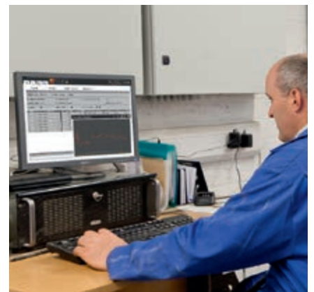
amacs on the farm office PC